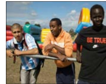
Young people at the Visy Cares Hub National Youth Week Event 2009

VICTORIA University (VU) - Youth Transitions at the Visy Cares Hub has case managed over one thousand clients and was able to career counsel and assist the majority of the clients into gaining entry to their chosen course throughout 2009. New and exciting pilot programs were delivered for young people who were disengaged from education aged from 15 to 24. These workshops focused on personal development and career/education options including getting ready to go back to study, resume writing, body image and the media, self esteem, sexual health, budgeting, leadership, professional ethics and behaviour, traineeships, and apprenticeships. The programs have made a positive contribution to disengaged young people who came into VU at the Visy Cares Hub offering them opportunities to reconnect their life choices and chances through education.