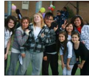
Young people at the 2009 Sunshine Showtime Youth Week Event

DURING 2010 Sunshine Youth Legal Centre will work closely with The Youth Junction Inc. to deliver their Better Outcomes Program for 18-25 year olds. This program will provide a case managed approach to young peoples needs, and will provide ongoing support to these young people.