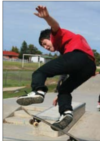
The Sudo Boiz-in partnership with The Youth Junction Inc.

-Our first 'Brimbank Fashion Week', involving Council's Brim-