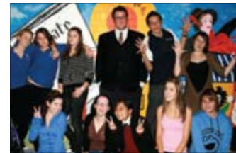
Participants of the Drama program

to identified services in a timely manner, by being introduced by their case worker, thus creating better outcomes in a seamless way. Other projects that SYH is involved in are: Establishing a community garden in Devonshire Rd "Homegrown" due for stage one completion in July 2010.